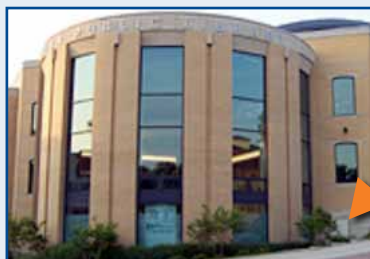
Aurora Public Library – studio entrance marked by an arrow on right of photo