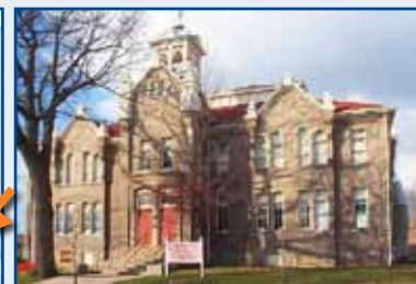
Aurora Cultural Centre (formerly Church Street School)