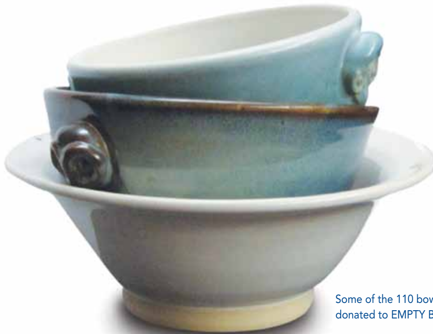
Some of the 110 bowls Pine Tree's members donated to EMPTY BOWLS in 2009

The Aurora's Pine Tree Potters' Guild is excited to announce that it will be hosting an EMPTY BOWLS fund-raising event to benefit the York Region Food Network and Welcoming Arms . Here is an opportunity for local potters to support these great causes and promote their work at the same time!